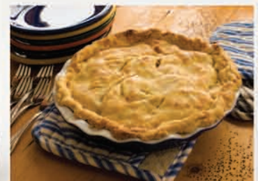
All-American Apple Pie

A PALMER/PLETSCH PUBLICATION $24.95 (higher outside US)