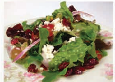
Reds & Greens Salad