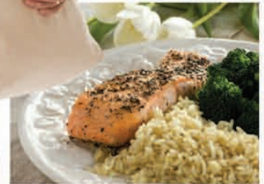
Roast Salmon with Tarragon